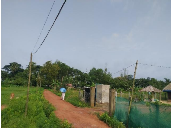
Road to the village