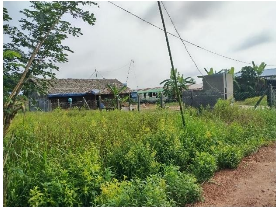
Our home from front view