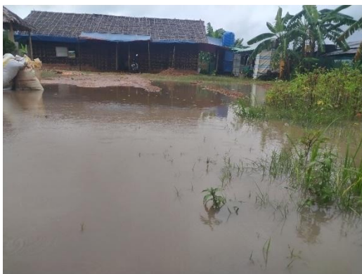
Rain flood at compound